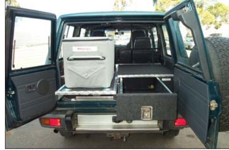
BW1000 Twin drawers with built in fridge slide fitted to Ford Maverick

Note: If vehicle fitted with full length barrier, BW900 drawers can be fitted.