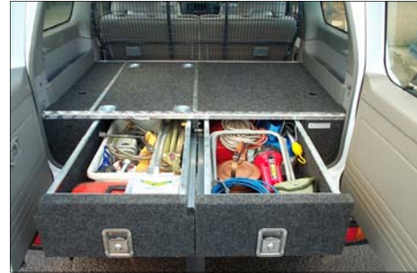
BW1000 Twin drawers & cargo barrier top GU Rear twin floor with cut out below

Note: If vehicle fitted with full length barrier, BW900 drawers can be fitted. (Twin floor not available to suit)