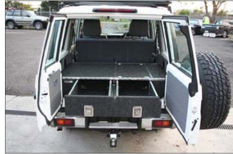
BW900 Twin drawers fitted to 76

|Recommended Fitting charge for all drawer Systems $275.00