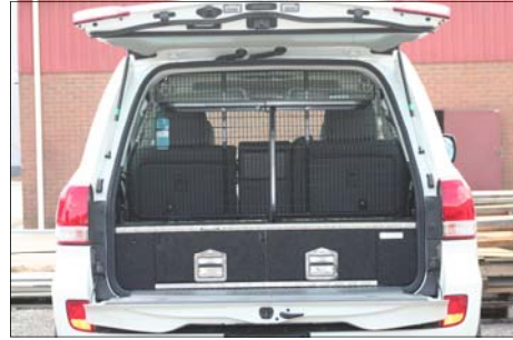
BW1000 Twin drawers, cargo barrier, top shelf and centre above. Tourer 2B below

Recommended Fitting charge for all drawer Systems $275.00