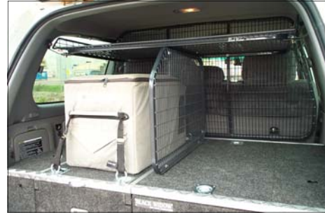
BW1000 Twin drawers, cargo barrier, top shelf and centre above. Tourer 2B below

Recommended Fitting charge for all drawer Systems $275.00